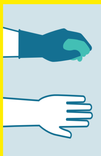
HOLD THE INSIDE-OUT GLOVE IN THE OTHER HAND