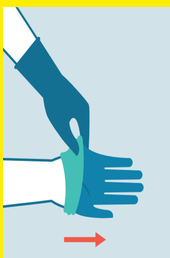
PEEL THE GLOVE AWAY FROM YOUR BODY, TURN IT INSIDE-OUT