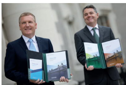
Minister for Finance Paschal Donohoe and Minister for Public Expenditure and Reform Michael McGrath at the launch of Budget 2022

It was announced in Budget 2022, that minimum rates of pay will increase from 1 January 2022. The national minimum wage for people aged 20 and over will increase by 30c to €10.50.